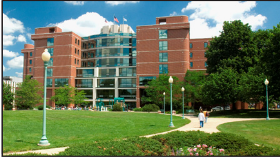
Akron Children's Hospital trusts Minitab Statistical Software when analyzing data for their quality improvement projects.